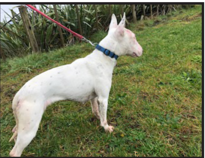
Top and above: Bull terrier Snow was severely malnourished and underweight when she was impounded.