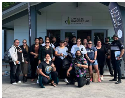
Above: Youth workers from around Kawerau at the Mana Taiohi Wānanga and Code of Ethics Training.

around Te Tiriti o Waitangi, the training has empowered attendees to better support and advocate for the youth in our community.