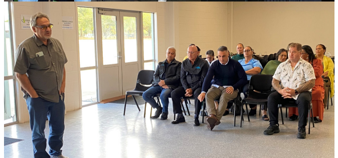
TOP: Tangata Whenua and Council staff standing to welcome the landowners and representatives from Whakatāne