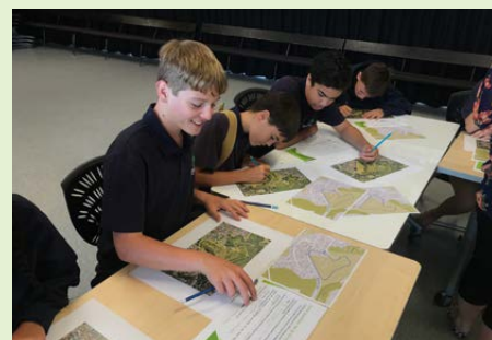
Tarawera High School year 9 literacy students work on their plans for the recreational reserve on Fenton Mill Road after discussing the pros and cons of the development in class recently.