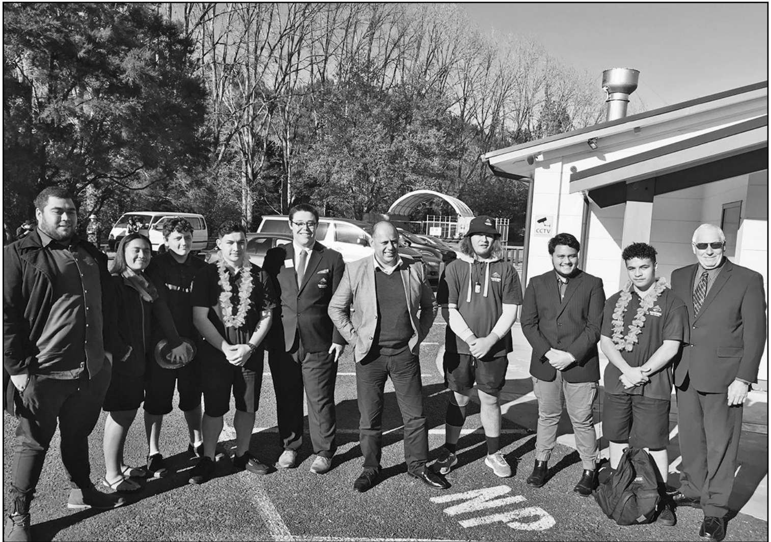
The Kawerau Youth Council and Tarawera High School students with Minister Willie Jackson (Centre) and Kawerau Mayor Malcolm Campbell.