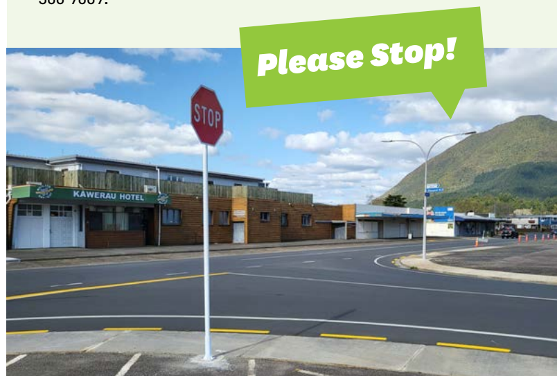
A new stop sign has been put in on Glasgow Street. This is to help keep motorists, pedestrians and cyclists safe.

Reminder that if you need to set up direct debit payments or discuss how to pay your rates and other Council invoices – please talk to our Customer Services team or call us on 07 306 9009.