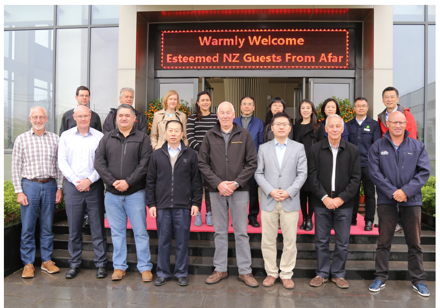
Right: The New Zealand delegation, comprising representatives from Kawerau District Council, central government and the Putauaki Trust as well as economic development and international relations consultants, was warmly welcomed during its visit to China in March.