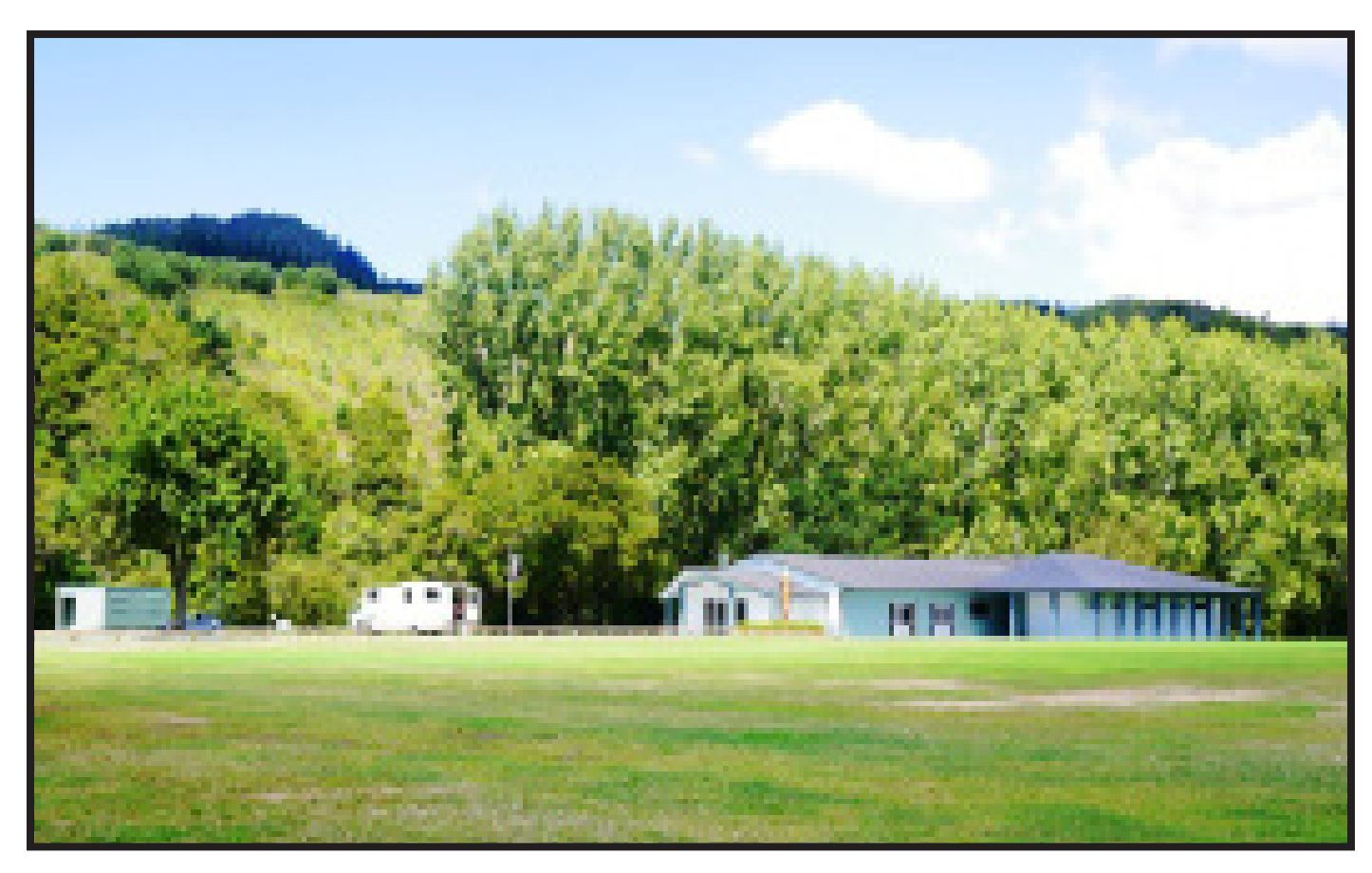
Firmin Lodge is one of Council's recently completed major projects.