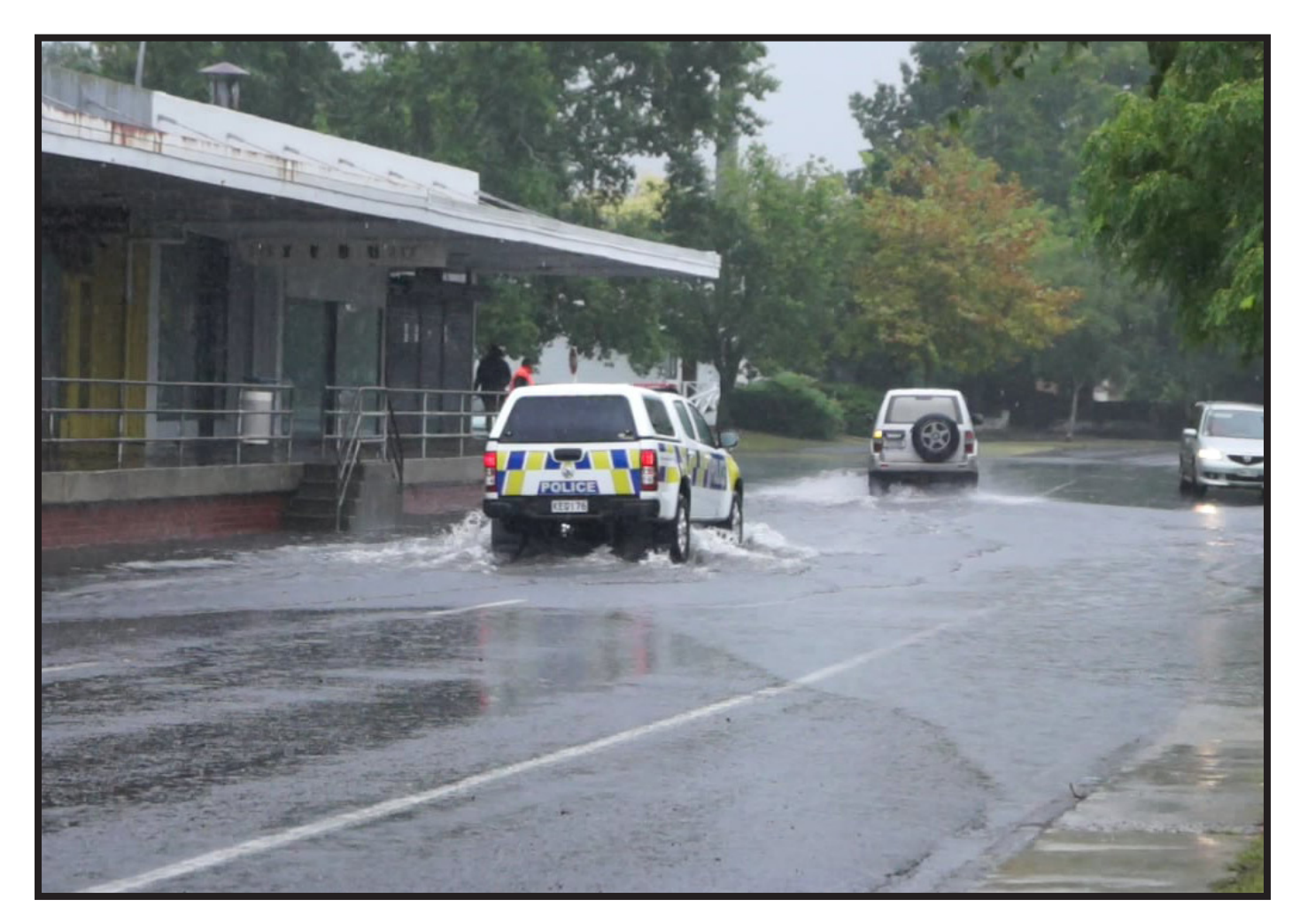
Kawerau roads were drenched last month when the town was hit with more than 400mm of rain in 24 hours.