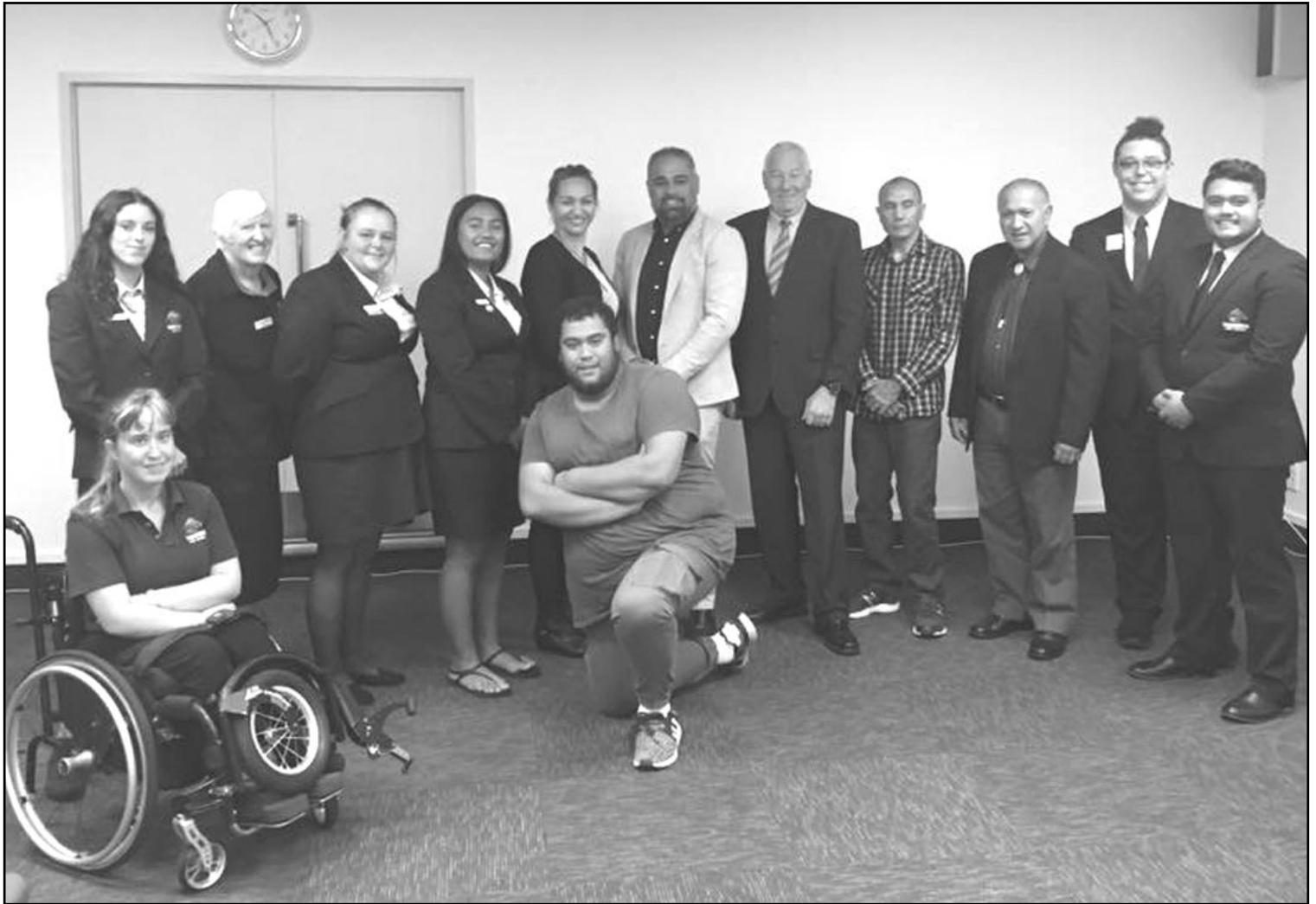
The Kawerau Youth Council, Tarawera High School deputy head boy and girl with the Minister of Youth Honourable Peeni Henare (centre), Mayor Malcolm Campbell, deputy Mayor Faylene Tunui, Kaumatua Graham Te Rire and councillors Warwick Godfery and Berice Julian.

The Kawerau Youth Council hosted the Minister for Youth the Hon. Peeni Henare on Thursday, March 28.