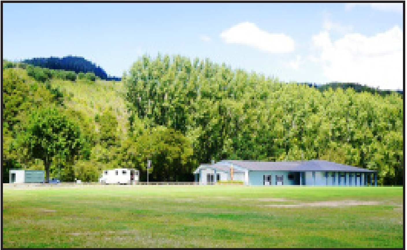
Firmin Lodge is one of Council's recently completed major projects.