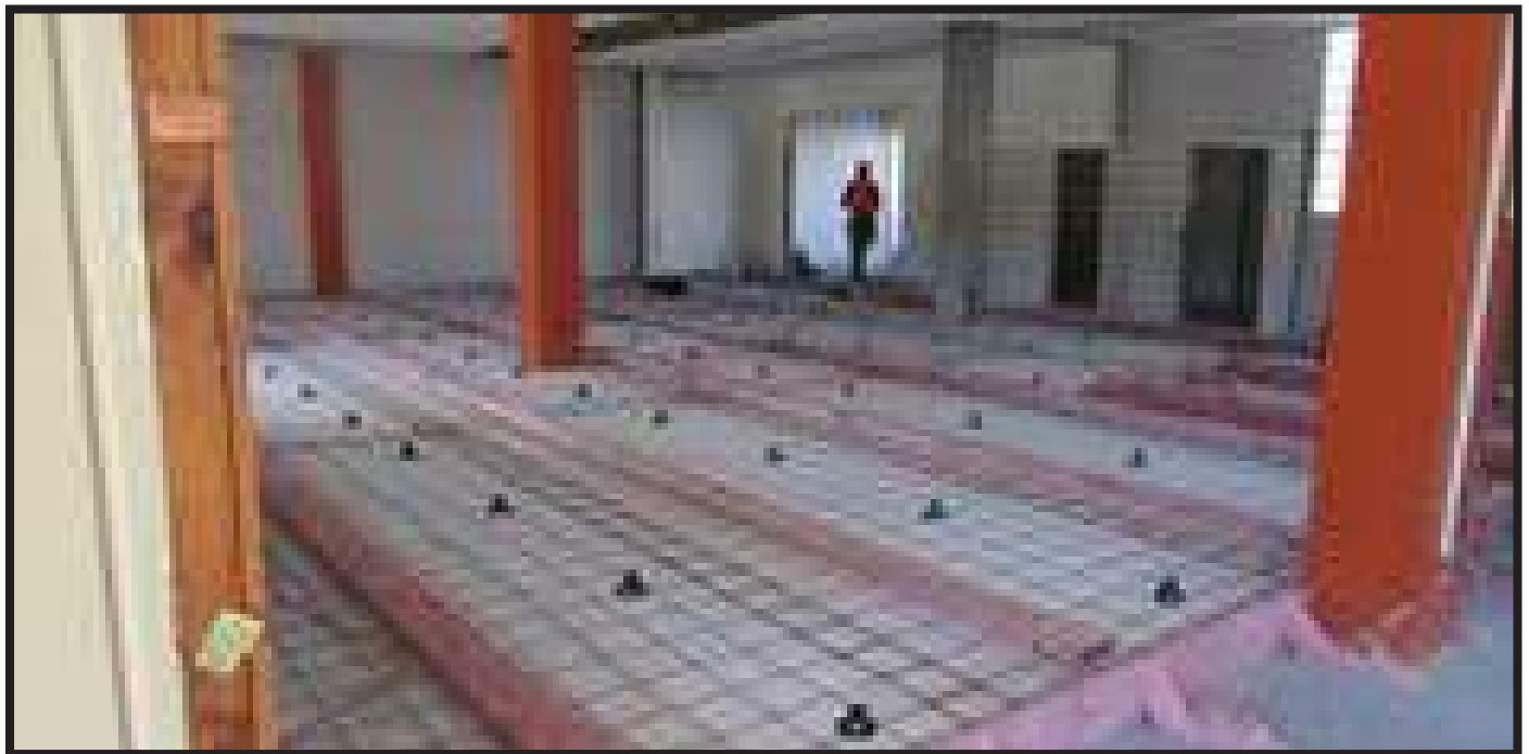
Top: Wren Builders' workers arrive on site to begin the job. Above: The floor in the new storage and workroom space is prepared.